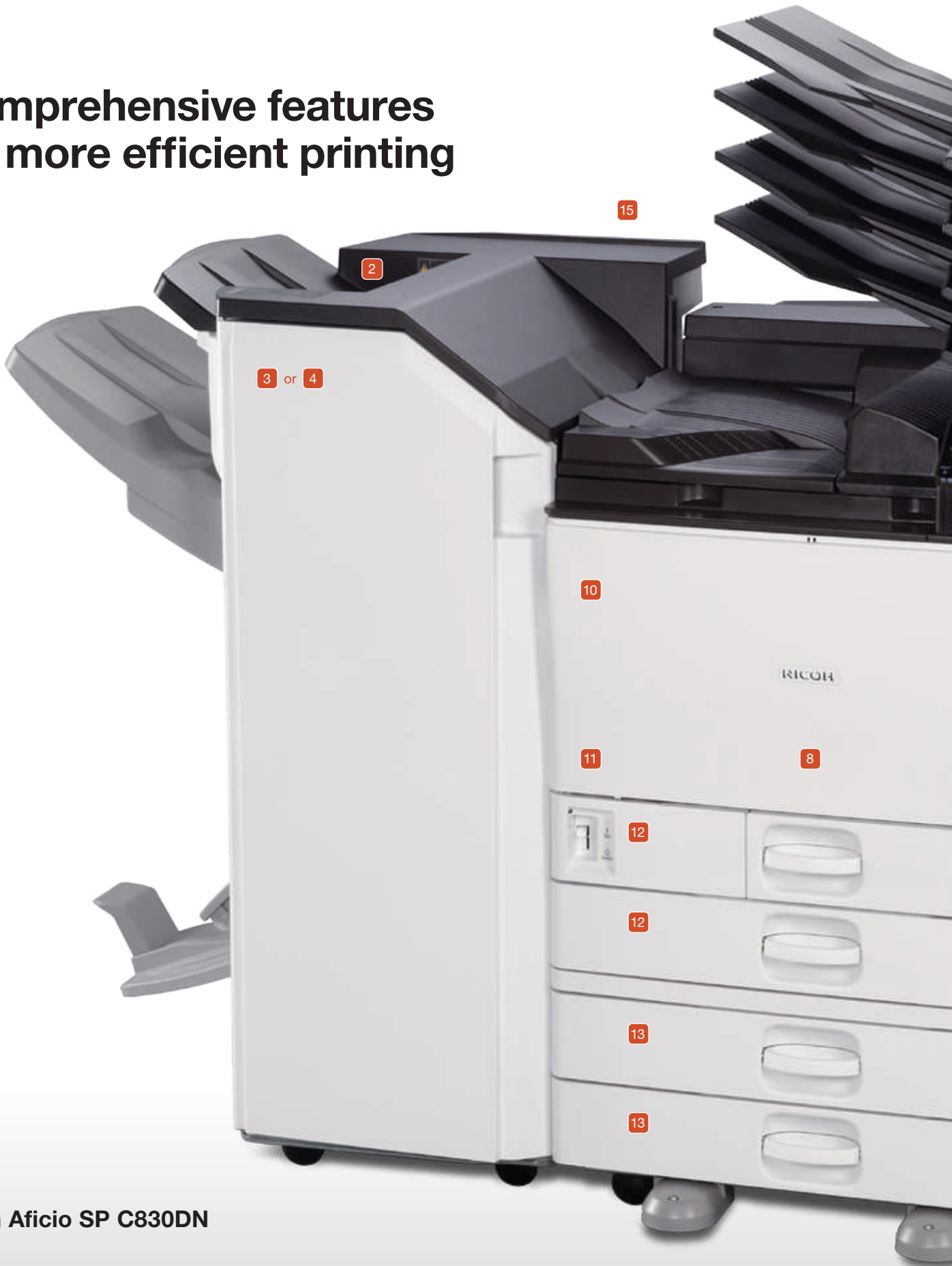
Ricoh Aficio SP C830DN